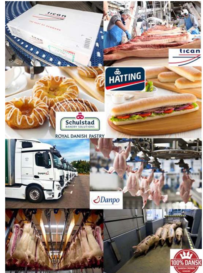
Danish Crown. Foto: Claus Sjöding 2005